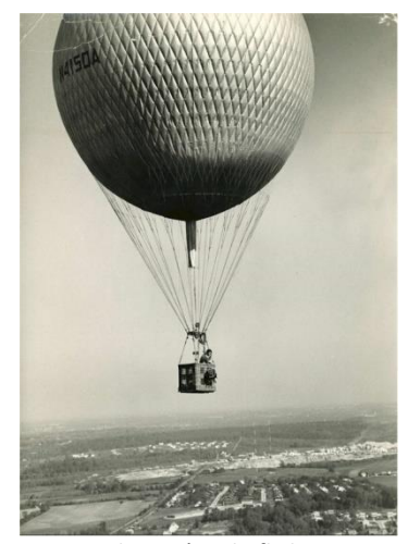
Eleanor's solo flight