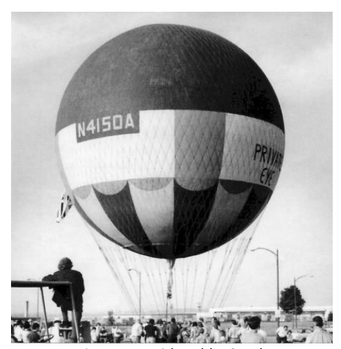
Private Eye with Bobby Sparks