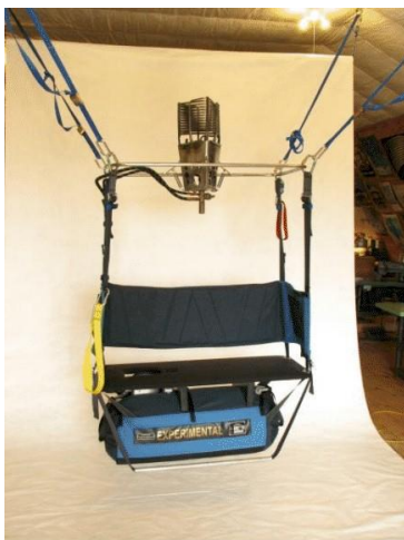
Super Lightweight Duo Balloon Lower End