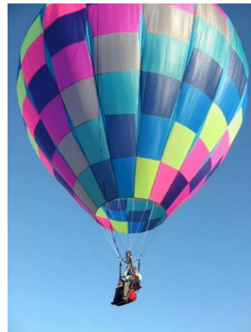
Super Lightweight One Person Balloon 2010