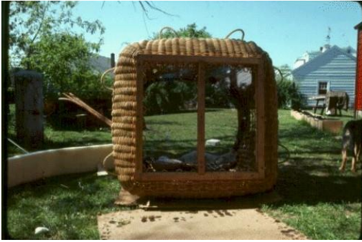
Glass Bottom Balloon Basket 1980