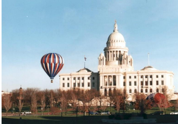
Montgolfier Regatta, Providence, RI 1998