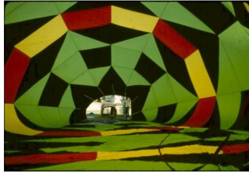
Glass Bottom Balloon 1980