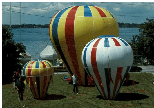
Cold Air Balloons 1990