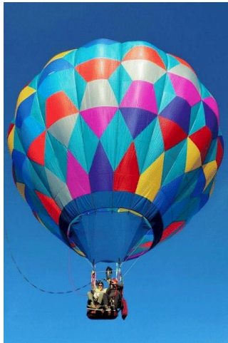
Super Lightweight Duo Balloon 2018